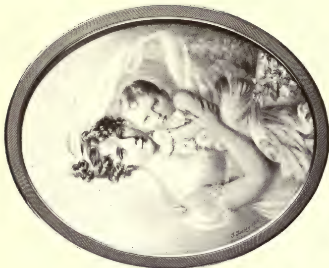
QUEEN HORTENSE AND HER SON, AFTERWARDS NAPOLEON III (1808-1873) BY JEAN BAPTISTE ISABEY